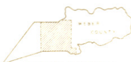
SHADED AREA REPRESENTS THE LOCATION OF THE ENLARGEMENT DRAWN ABOVE

UTAH STATE DEPARTMENT OF HIGHWAYS RESEARCH SECTION STATE ROAD CHANGES Legend — Addition to State Road System - - - Deletion from State Road System